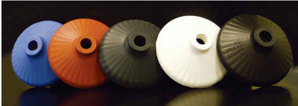
The grey disk, shown in the center, is the industries first silicone metal detectable disk.

Instances of Solimar fluidizer disks contaminating product are extremely rare, but disks that have been mechanically damaged during bin cleaning, by extreme air pressures or improper installation could potentially cause a problem. Designed to meet the stringent process requirements primarily of the dairy, pharmaceutical and food related industries; Solimar Pneumatics has developed the first Metal Detectable Fluidizer Disk. Your only choice when zero contamination is a must.