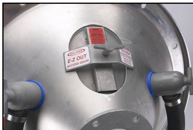
Easy Out Access Door on bulk trailer bottom

A Tradition of Leadership. Solimar has over 40 years of experience in pneumatic systems and components for dry bulk handling. Solimar Products are used in over 60 countries around the world in over 120 bulk material applications.